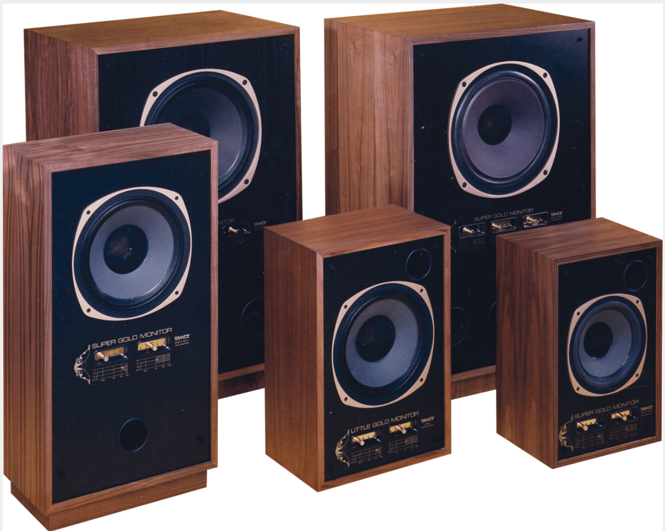
Tannoy Dual Concentric